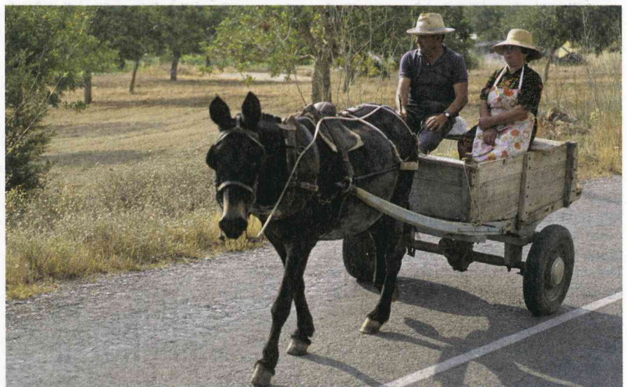
Off to join the Mittelstand

Raising these numbers is not easy, of course, despite a reported jump in demand for German-language tuition in peripheral economies. Job-seeking Europeans will never be as footloose as their American counterparts. But the gap can be narrowed. The periphery may now be the main target of structural reform, but streamlining relevant rules in the core economies would do as much to help euro-zone citizens. ■